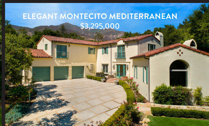
ELEGANT MONTECITO MEDITERRANEAN $3,295,000