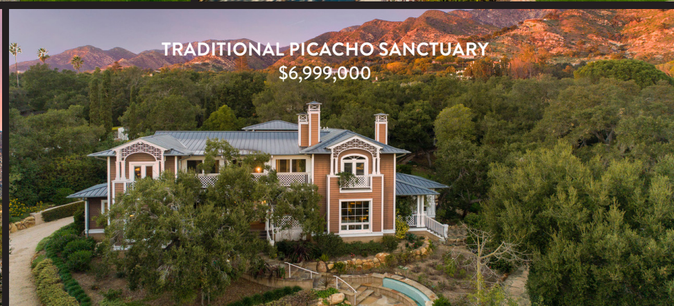
TRADITIONAL PICACHO SANCTUARY $6,999,000