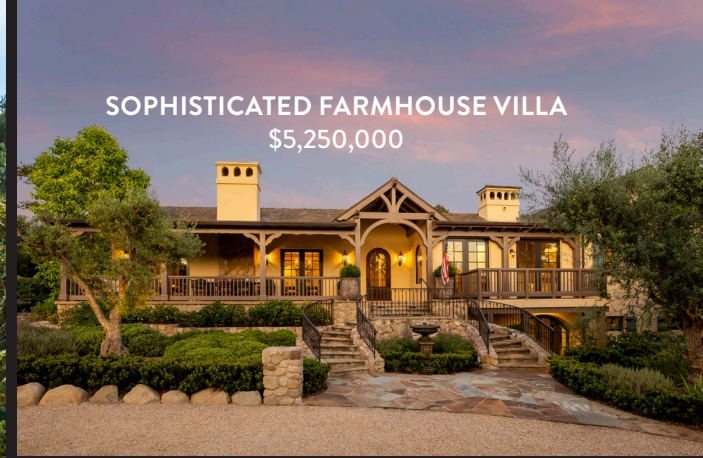
SOPHISTICATED FARMHOUSE VILLA $5,250,000