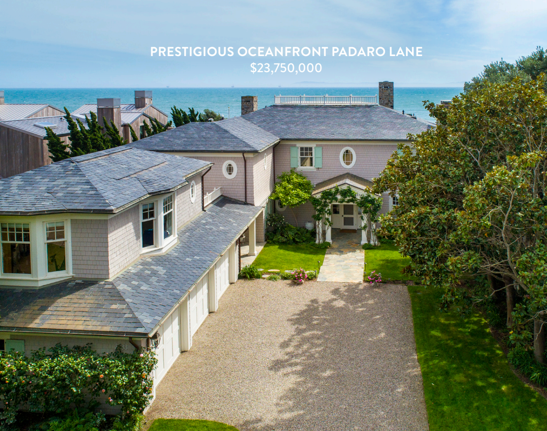
PRESTIGIOUS OCEANFRONT PADARO LANE $23,750,000