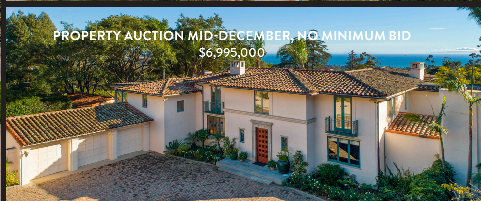
PROPERTY AUCTION MID-DECEMBER, NO MINIMUM BID $6,995,000